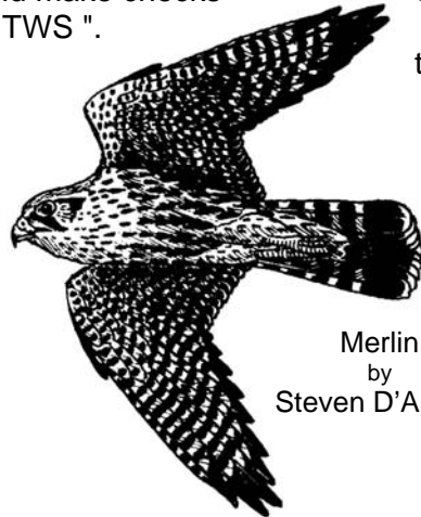
Merlin