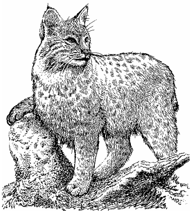
Bobcat