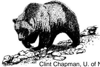
Clint Chapman, U. of Nebraska

The Montana Chapter recently prepared a position statement supporting the proposed delisting of the grizzly bear in the Greater Yellowstone Ecosystem. It is noted that all